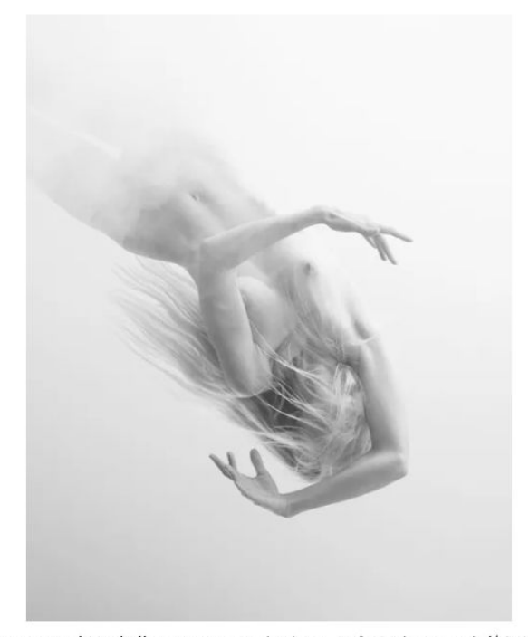
Ransom and Mitchell Entwine Limited Edition 1 of 10 Photograph ($1600)

It's no secret how this photograph of Big Sur ended up in a collection of art inspired by BLL . A soft morning light bounces off the ocean as it calmly traces the coastline. It's a beautiful scenic image not unlike many included in the HBO series.