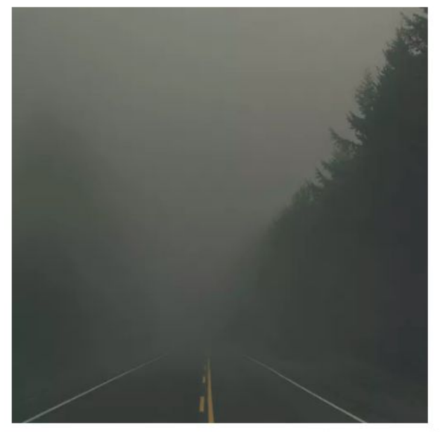
Mackenzie Duncan Barely Holding On Limited Edition of 10 Photograh ($2410)

A haunting photograph of a two-lane road surrounded by forest trees engulfed in fog, this work is dark, yet beautiful. Surely, it reminds BLL fans of all the times the series shows characters driving along stretches of highway while captivating music plays in the background.