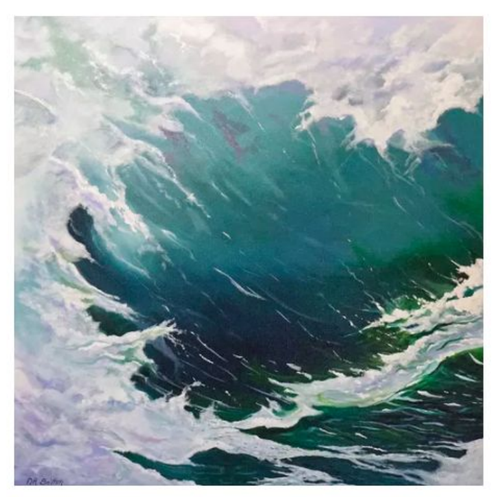
Donald Britton Pacific Spa Painting ($4550)

What could be more evocative of the Monterey, California setting of Big Little Lies than a painting of a wildly crashing wave in the Pacific ocean? The tight frame of the work makes you feel like you're right there, swimming in the water, about to be taken over by the wave.