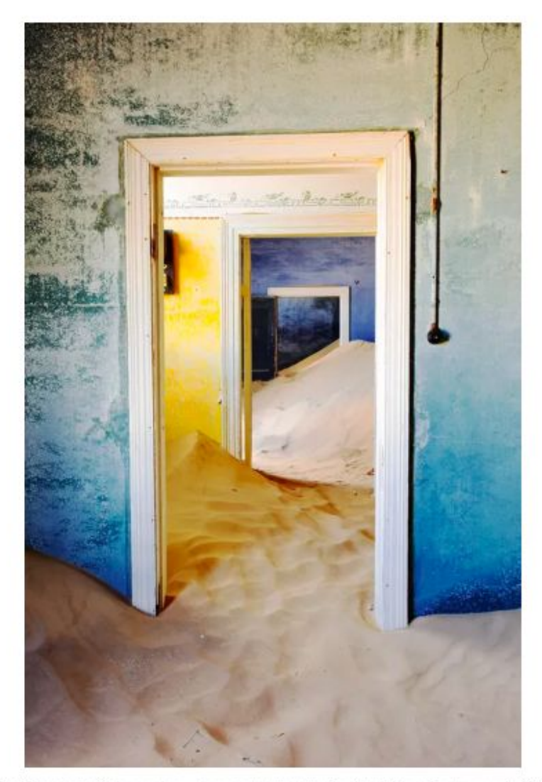
Pieter Geevers Kolmanskop Fine Art Print Limited Edition Photograph ($930)

Although it has the appearance of a surrealist painting, this work is actually a photograph of an abandoned town in Southwest Namibia called Kolmanskop. What was once the center of the prosperous diamond industry has since been flooded by sand dunes, creating an apocalyptic scene for photographer Pieter Geevers to capture.