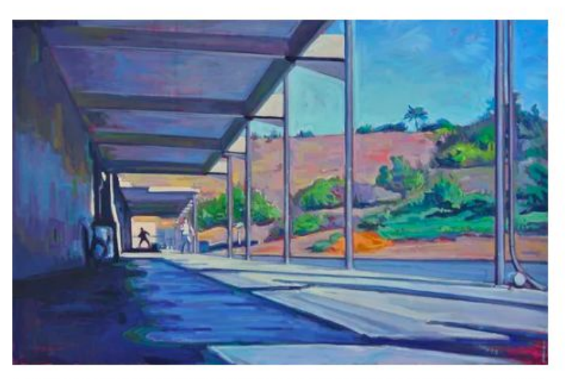
Benjamin Gaboury San Clemente High School Painting ($2610)

What could be more evocative of the Monterey, California setting of Big Little Lies than a painting of a wildly crashing wave in the Pacific ocean? The tight frame of the work makes you feel like you're right there, swimming in the water, about to be taken over by the wave.