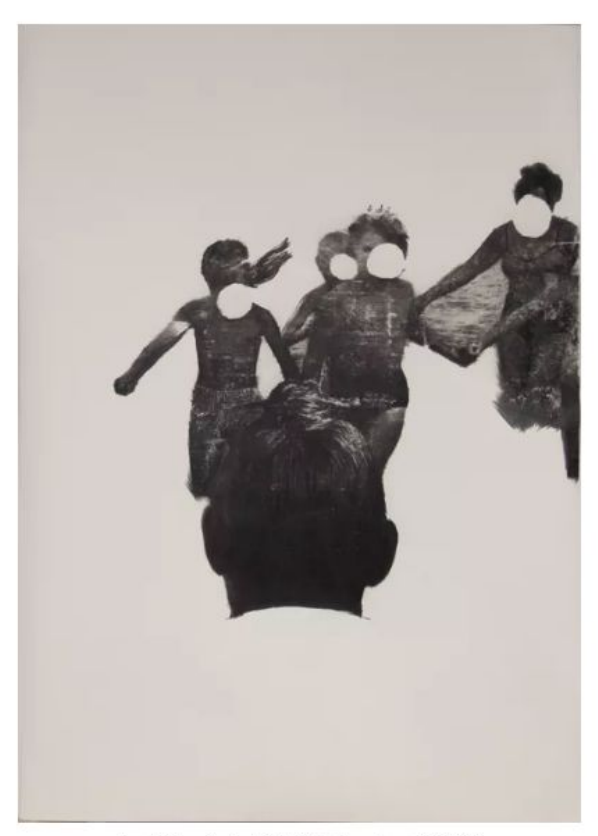
Pawl Mendrek ARIADNE Drawing ($1890)

A haunting photograph of a two-lane road surrounded by forest trees engulfed in fog, this work is dark, yet beautiful. Surely, it reminds BLL fans of all the times the series shows characters driving along stretches of highway while captivating music plays in the background.