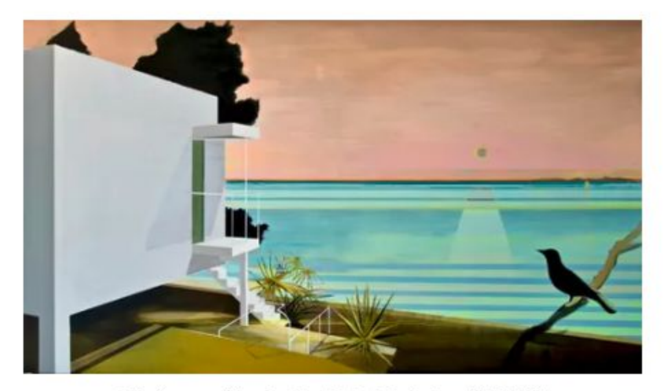
Cécile van Hanja Blackbird Painting ($3950)

This painting depicts a Mediterranean landscape, including a sleek, modern home, a sunset over the ocean, and an ominous blackbird watching over. The modern architecture paired with the ocean view is reminiscent of Big Little Lies .