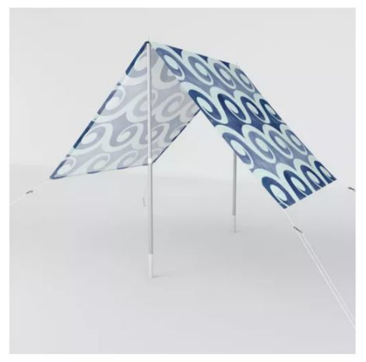
moderntropical Indigo Blue Woodblock Sun Shade ($199)

Simply set up this sun shade for instant relief from the hot summer sun. Unlike typical sun umbrellas, it offers a large area of shade and features a unique design.