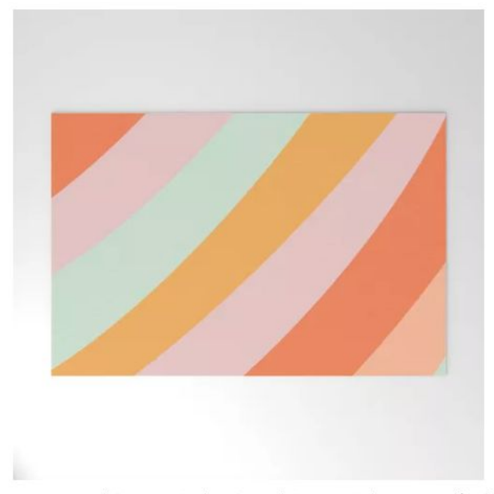
june//journal Summer Sorbet Curved Stripes Welcome Mat ($55)

This bright floor cushion offers function and style. It's made for the outdoors so you don't have to worry about it getting wet or dirty when used in the grass or on a deck. Plus, it features a trendy leopard print design for a playful look.