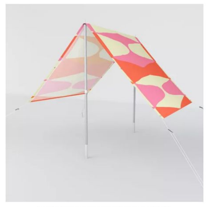
Caligrafica Zaha Sixties Sun Shade ($199)

Escape from the sun and heat underneath this bright and colorful tent boasting a retro print in pink, orange, and cream shades. Set up a picnic blanket and chairs below the cover and enjoy a day spent outdoors.