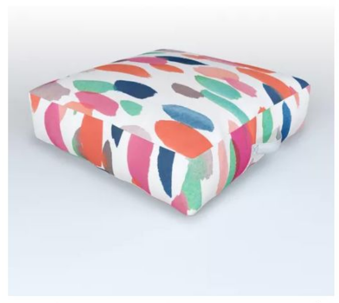
Steve Haskamp Watercolor Dashes Outdoor Floor Cushion ($99)

Escape from the sun and heat underneath this bright and colorful tent boasting a retro print in pink, orange, and cream shades. Set up a picnic blanket and chairs below the cover and enjoy a day spent outdoors.