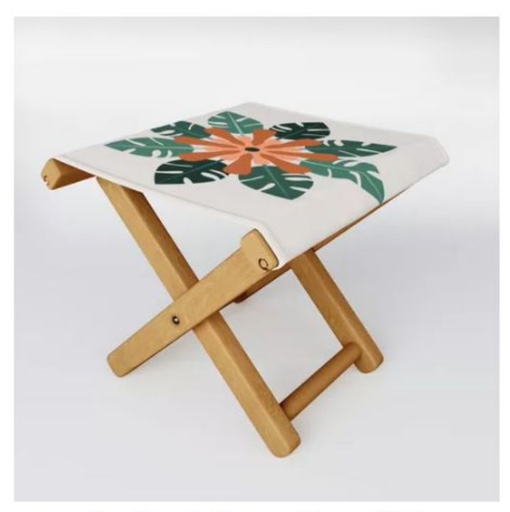
Olooriel Tropical Flower Folding Stool ($49)