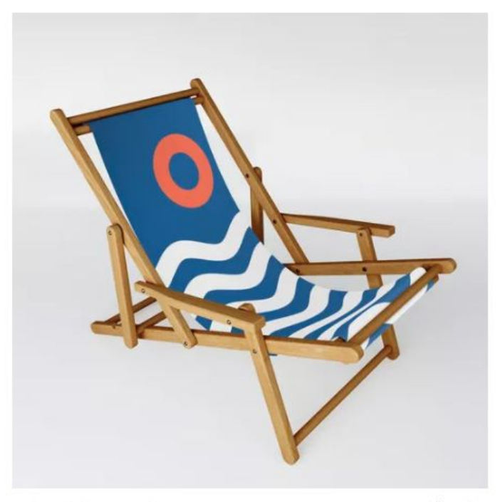
The Old Art Studio Nautical 03 Seascape Sling Chair ($149)

This folding stool is emblazoned with a yellow and white polka dot pattern that's perfectly cheery. Use it to kick your feet up or hold small items off of the ground.