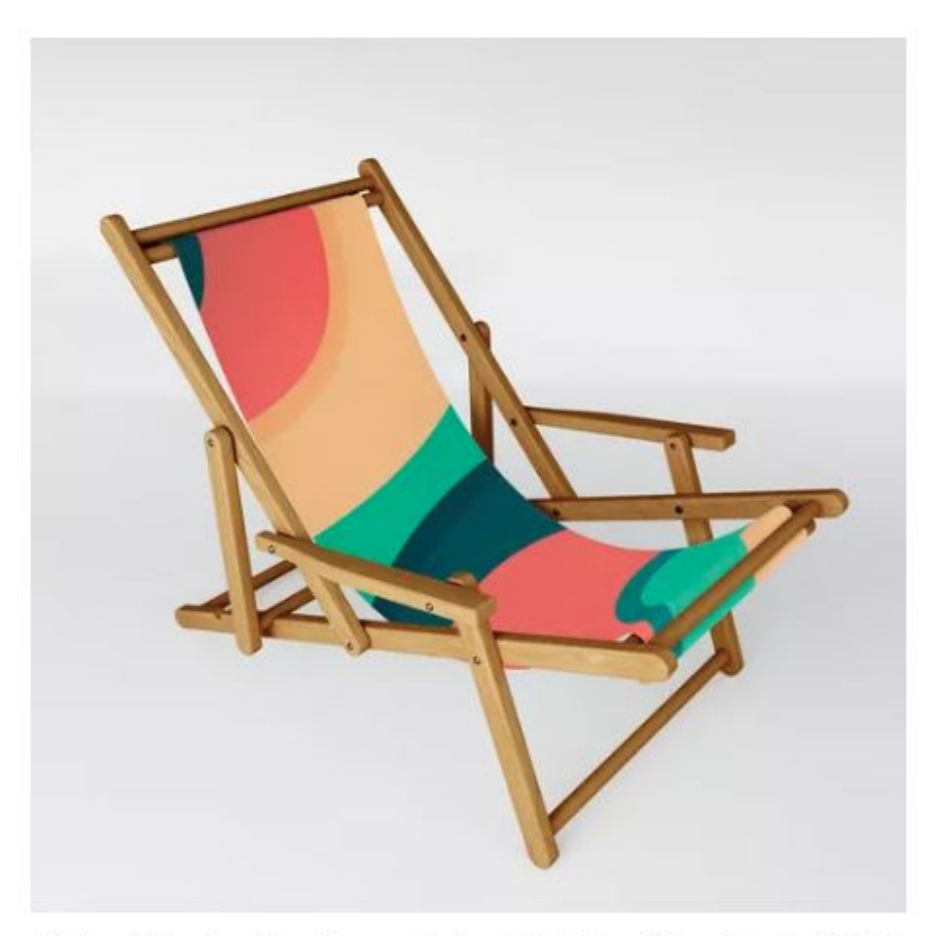
DistinctyDesign The River, Abstract Painting Sling Chair ($149)

The line includes sling chairs, sun shades, folding stools, picnic blankets, floor cushions, and welcome mats that boast colorful, retro-inspired prints. Keep scrolling to shop the new collection.