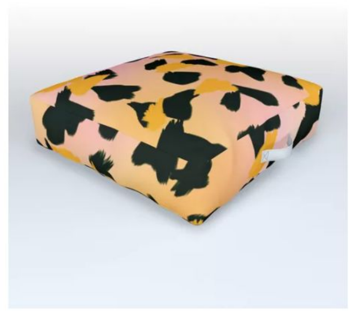
Päivi Vikström Painted Leopard Skin Outdoor Floor Kitchen ($99)

This bright floor cushion offers function and style. It's made for the outdoors so you don't have to worry about it getting wet or dirty when used in the grass or on a deck. Plus, it features a trendy leopard print design for a playful look.