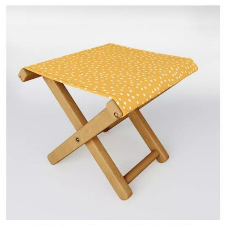
Priscila Peress Yellow Dots Folding Stool ($49)

This folding stool is emblazoned with a yellow and white polka dot pattern that's perfectly cheery. Use it to kick your feet up or hold small items off of the ground.