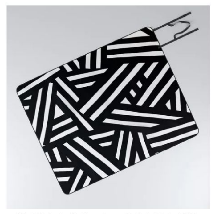
The Old Art Studio Monochrome 01 Picnic Blanket ($99)

This picnic blanket is graphic and minimal with black and white overlapping stripes. Bring it to a park or the beach for a cool outdoor lunch set up.