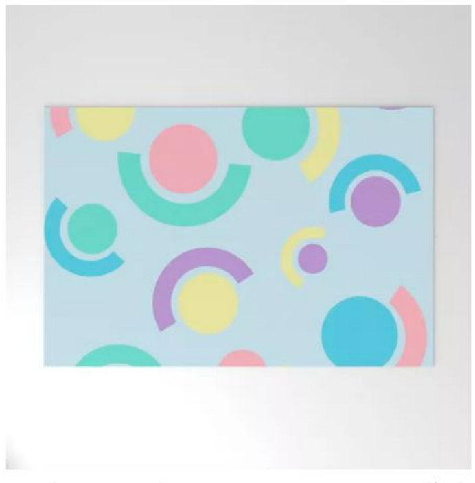
Kenedi Design Co Abstract Circles & Dots Welcome Mat ($55)

This picnic blanket is graphic and minimal with black and white overlapping stripes. Bring it to a park or the beach for a cool outdoor lunch set up.