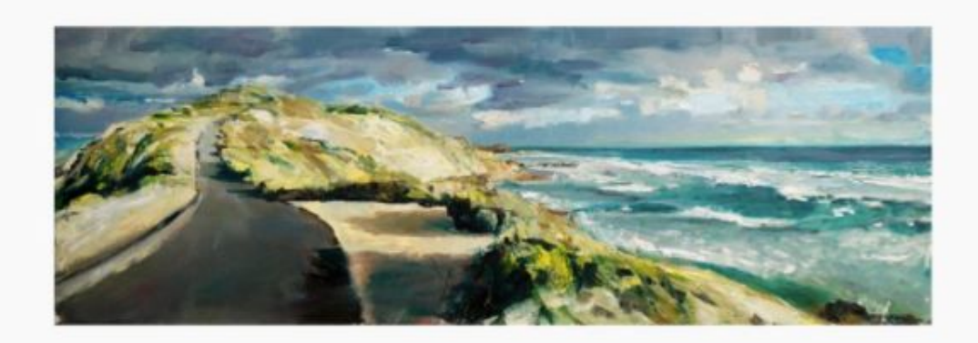
Kristian Mumford/Courtesy Saatchi

As impressionist artists in Australia go, Kristian Mumford is one of the most recognizable names. His work fuses impressionism with realism, and he often depicts natural Australian scenery (his Strength piece is perfect for any art lover aching for Australian beaches). He also regularly draws and paints female subjects, some integrated into natural landscapes, others featured in loosely sketched, head-on portraits. Whether sketching in black and white or illustrating a far-off, ethereal-looking figure in a flowing dress walking along the waterfront, his work brings a soft, accessible impressionist quality. Mumford's art is available for purchase at Saatchi Art.